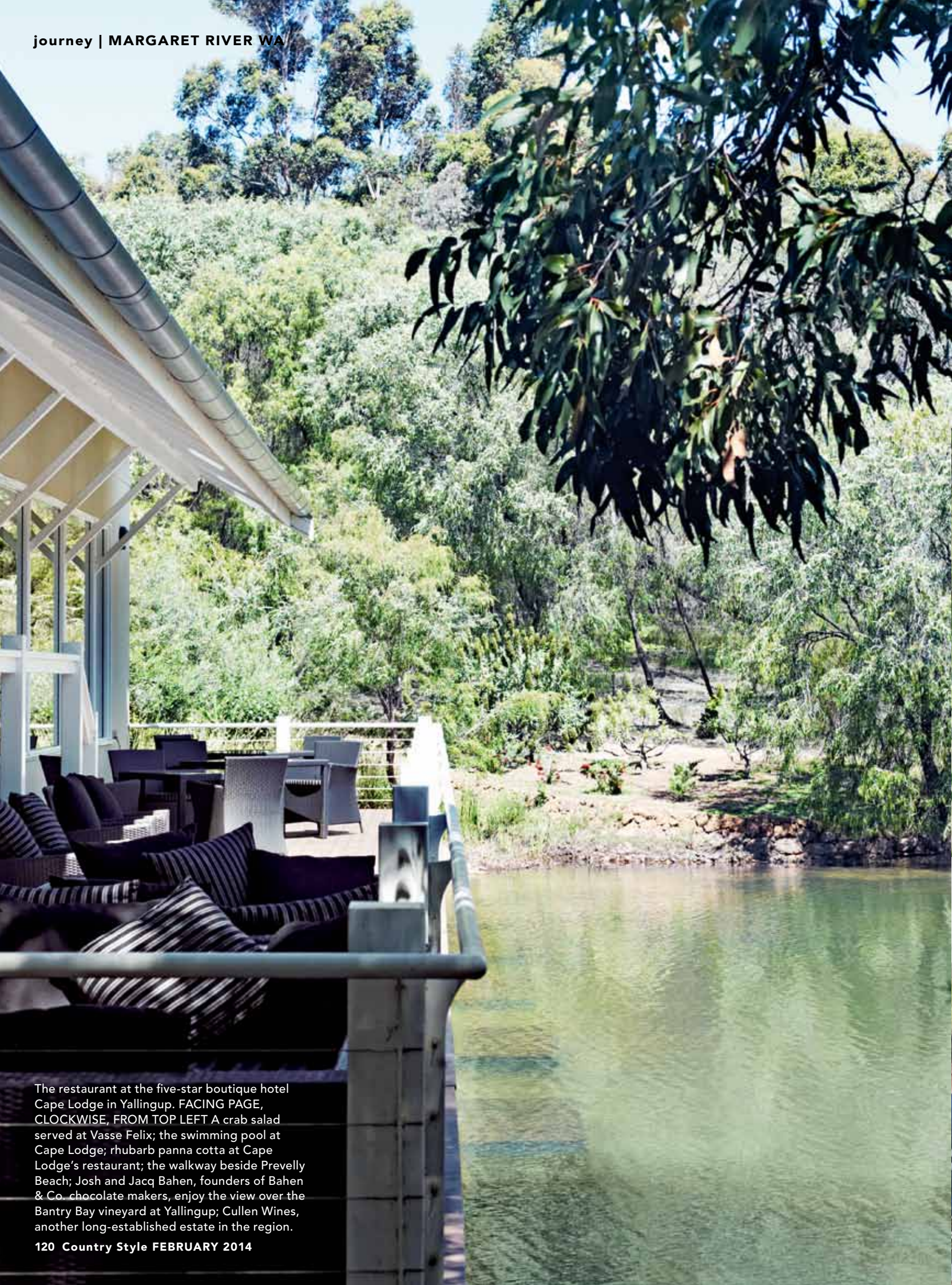
The restaurant at the five-star boutique hotel Cape Lodge in Yallingup. FACING PAGE, CLOCKWISE, FROM TOP LEFT A crab salad served at Vasse Felix; the swimming pool at Cape Lodge; rhubarb panna cotta at Cape Lodge's restaurant; the walkway beside Prevelly Beach; Josh and Jacq Bahen, founders of Bahen & Co. chocolate makers, enjoy the view over the Bantry Bay vineyard at Yallingup; Cullen Wines, another long-established estate in the region.